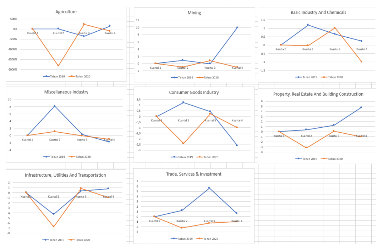
Figure 2. Financial Performance of the Industrial Sector in 2020